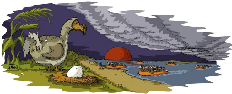
Picture 4: Winning caricature Uprchlíci a Evropané jako „Blbouni nejapní“ by Marek Simon

Source: KLEMPÍŘ, D.: Evropané jako „blbouni nejapní“. Česká karikatura roku reaguje na uprchlíky. Released on 12.03.2019. [online]. [2019-03-12]. Available at: < https://www.blesk.cz/clanek/zpravy-kultura/359769/evropane-jako-blbouni-nejapni-ceska-karikatura-roku-reaguje-na-uprchliky.html >.