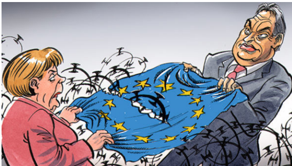
Picture 5: Caricature of the dispute between Viktor Orbán and Angela Merkel

Source: KLEMPÍŘ, D.: Evropané jako „blbouni nejapní“. Česká karikatura roku reaguje na uprchlíky. Released on 12.03.2019. [online]. [2019-03-12]. Available at: < https://www.blesk.cz/clanek/zpravy-kultura/359769/evropane-jako-blbouni-nejapni-ceska-karikatura-roku-reaguje-na-uprchliky.html >.