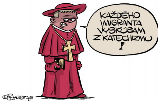
Obrázok č.2: Karikatúra Slovenská inkvizícia Zdroj: Dennik N, 23.07.2015